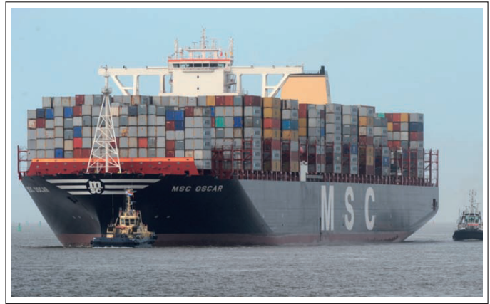
MSC is equipping with larger newbuilds.

Reported to have "already significantly exceeded" mandatory requirements regarding fire safety in its build programme, MSC is also equipping the newbuilds with a dual tower firefighting system, advanced early warning systems and other equipment to promptly control and cool down any fires.